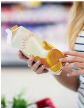
Other plate - CMYK + SPOT