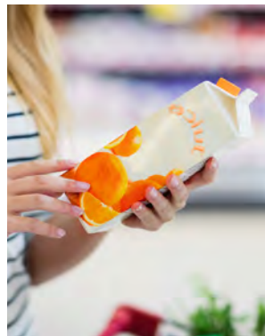
AWP™-DEW - with EGP